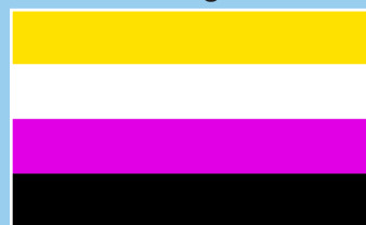
Nonbinary Pride Flag