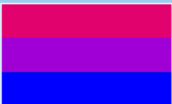
Bisexual Pride Flag