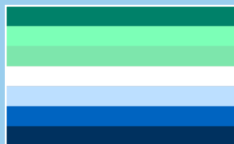
Man-loving-Man Pride Flag