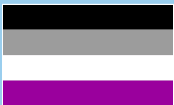
Asexual Pride Flag