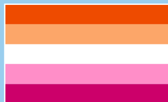
Lesbian Pride Flag