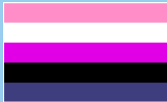
Bigender/Gender-Fluid Pride Flag