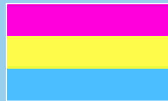
Pansexual Pride Flag