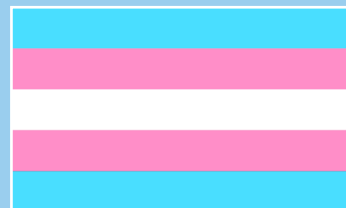
Transgender Pride Flag