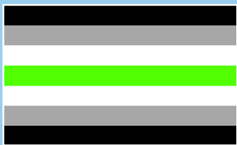
Agender Pride Flag