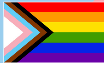
Progress Pride Flag

Many people think the Rainbow Flag is the only one in our community. While the Rainbow flag represents all LGBTQ+ people, here are a few more flags and their meanings!