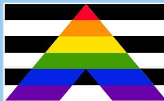
LGBTQ+ Ally Flag