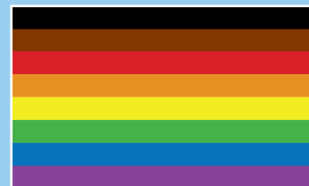
Philadelphia Pride Flag