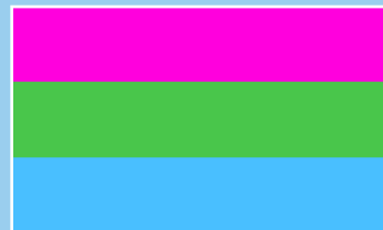
Polysexual Pride Flag